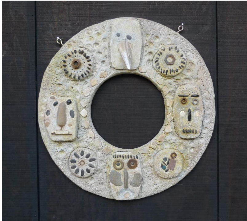
Untitled collaborative sculpture, concrete and found objects