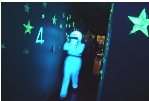
Entering the Starship CreateAbility