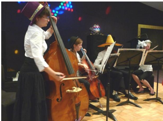
Ditaglio Minore play beautiful music